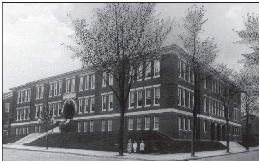
1906 West Chester High School

Students in what was then known as West Chester High School continued to study in the 1863 building until 1906, when a new high school building opened on adjacent property on North Church Street. By that time, many of the traditions that are part of Henderson today were well established. Foremost among them was the annual D. Webster Meredith Boys Speaking Contest, initiated in 1890 by a high school graduate.