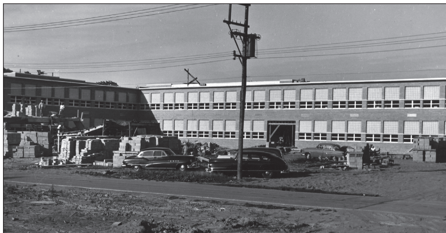
Henderson east side construction 1954