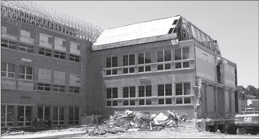
East side construction 2003

At Henderson, the addition that was part of the construction project gives the school a clearly defined new main entrance. Administrative offices, which were divided between the east and west entrances of the old Henderson, are together in one space to the left of the entrance foyer. Guidance offices are on the right. Science laboratories, family and consumer science classrooms, and a video production classroom and studio, all equipped to meet 21st century learning needs, are also located in the addition.