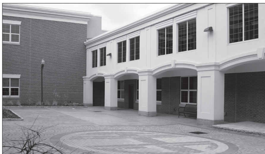
New central courtyard surrounded by both the new addition and the old building

In summary, we are proud of the rich history that has shaped Henderson High School into a respected and beloved community institution. As we celebrate and build on the traditions of the past, we look forward to a bright future for ourselves, our school, and the generations of students to come.