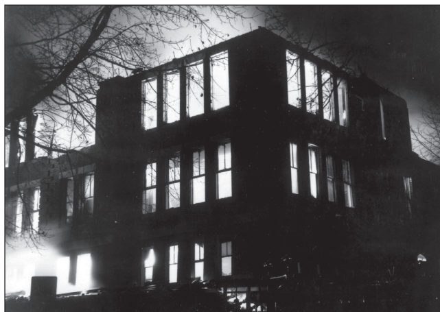
High school fire in 1947

Emotions ran deep for those who witnessed the fire because the building was such a source of community pride. Indeed, the high school by the time of the fire had a reputation for excellence that spilled beyond the boundaries of West Chester Borough.