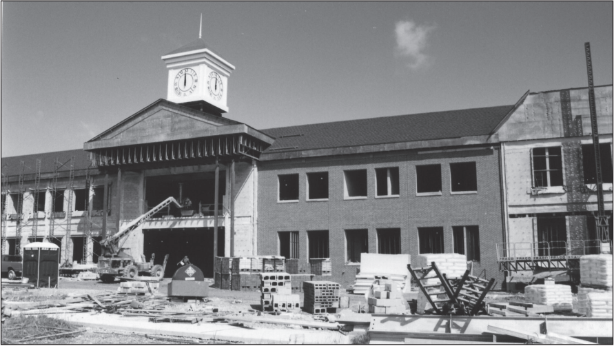
Construction of new front entrance 2003

fall of 2006. The work at East and Henderson were also completed that fall, with only some site work at Henderson remaining through the winter and spring.